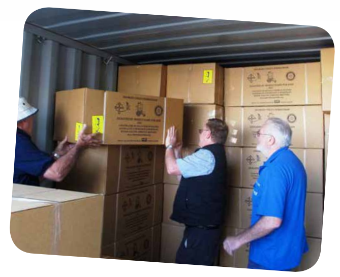
Pictured: Volunteers packing the containers for shipment to Tanzania

We are always looking for more people to assist in packing the containers. Please contact Lily on info@asanterafiki.com if you are interested volunteering a few hours of your time.